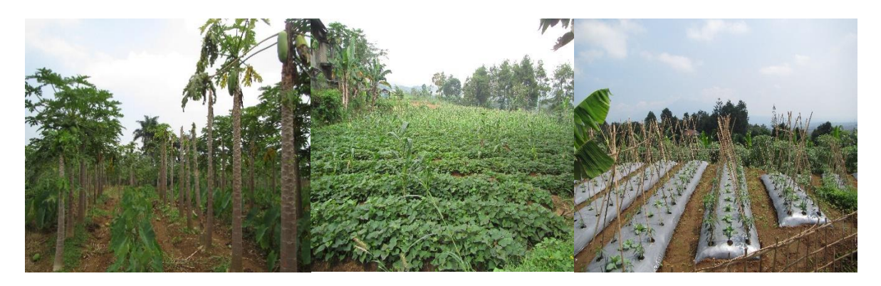
Figure 1. Agricultural landscape condition of upstream Ciliwung watershed