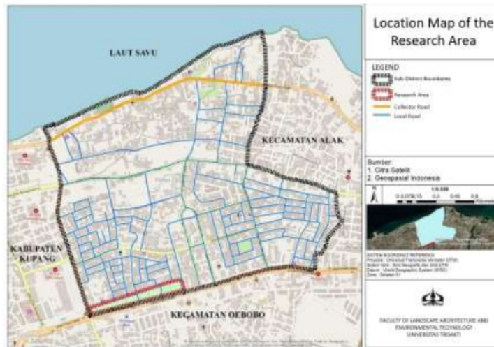
Figure 1. Location Map of the Research Area