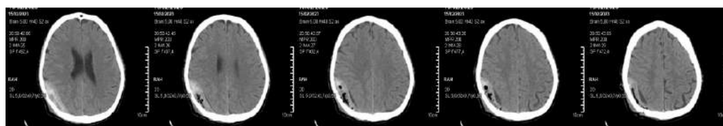
Figure 2 Postoperative head CT scan