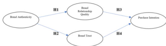
Fig. 1. Conceptual framework.

Based on the description explained, it can be concluded that this research will use the conceptual framework shown in the following figure: