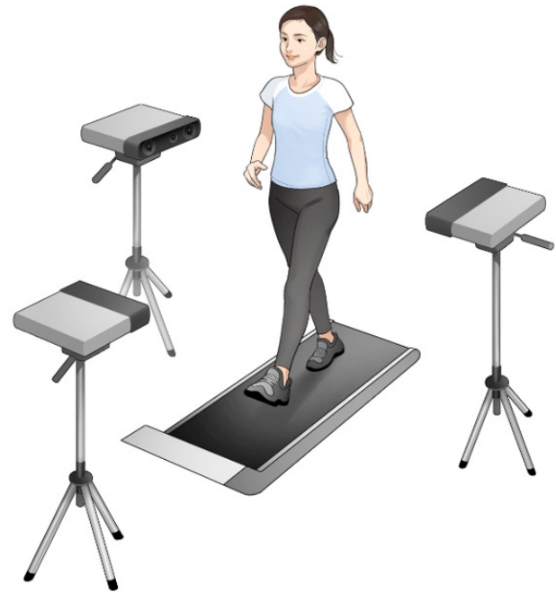
Fig. 1. Experimental setup for motion tracking. The frontal depth sensor pointed directly toward the treadmill for the full-frontal plane view, and the other sensors pointed to the sides (left and right arm) orthogonal to the frontal camera.

Motion during the experiment was captured at 30 Hz, and data acquisition proceeded using markerless motion capture software (iPi Motion Capture, LLC) (Fig. 2A). Inverse dynamics were computed from the kinematic measurement values (ROM, position, velocity, and acceleration of elbow and shoulder) of the depth sensor data. The elbow was considered to be set at 2 de-