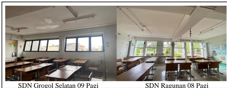
Figure 2. Ventilation and Windows in Net Zero Carbon School Spaces

Figure 2 shows the two net-zero carbon schools, SDN Grogol Selatan 09 Pagi and SDN Ragunan 08 Pagi, which have green building concepts implemented in their school buildings. These buildings feature ample air ventilation and sufficient room windows. The ventilation and room windows are an implementation of the green building criteria based on the aspects of Energy Efficiency and Conservation, as well as Air Quality and Room Comfort, applied to these two net-zero carbon schools in South Jakarta. The abundance of ventilation and room windows facilitates the entry of sunlight and air into the rooms, thus helping to save energy by reducing the need for artificial lighting and room cooling. Additionally, both SDN Grogol Selatan 09 Pagi and SDN Ragunan 08 Pagi also provide solar panels that can be used as an energy source by absorbing sunlight and converting it into electricity. These solar panels automatically activate every day and help conserve the electricity consumption of both net-zero carbon schools.