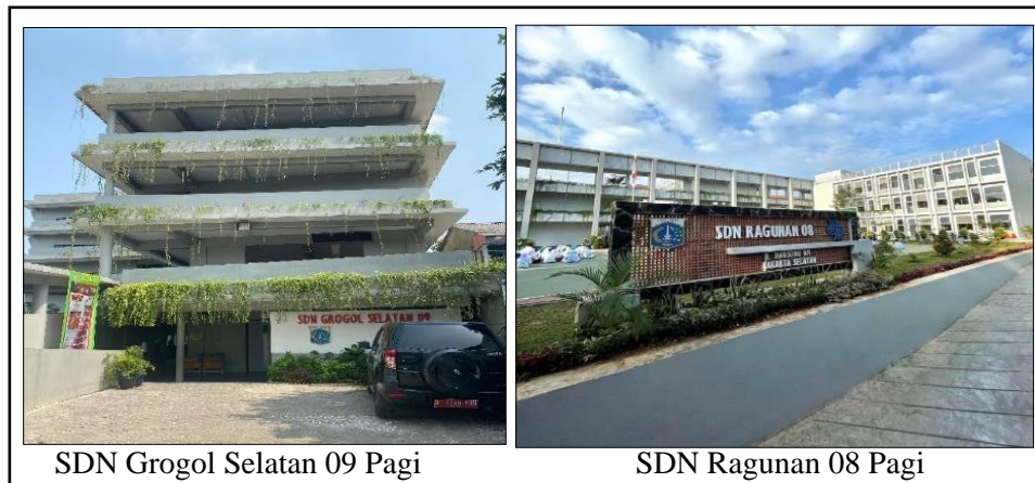
Figure 1. Green Building