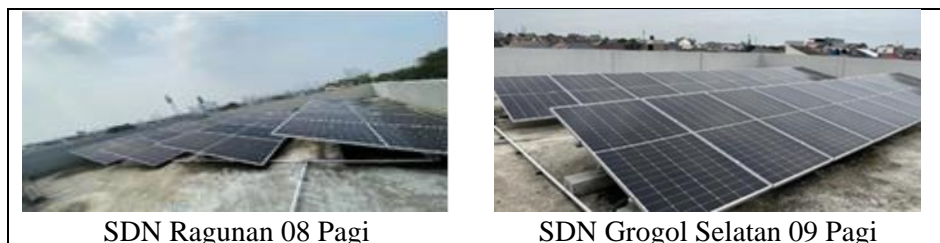
Figure 3. Solar Panel

Figure 2 shows the two net-zero carbon schools, SDN Grogol Selatan 09 Pagi and SDN Ragunan 08 Pagi, which have green building concepts implemented in their school buildings. These buildings feature ample air ventilation and sufficient room windows. The ventilation and room windows are an implementation of the green building criteria based on the aspects of Energy Efficiency and Conservation, as well as Air Quality and Room Comfort, applied to these two net-zero carbon schools in South Jakarta. The abundance of ventilation and room windows facilitates the entry of sunlight and air into the rooms, thus helping to save energy by reducing the need for artificial lighting and room cooling. Additionally, both SDN Grogol Selatan 09 Pagi and SDN Ragunan 08 Pagi also provide solar panels that can be used as an energy source by absorbing sunlight and converting it into electricity. These solar panels automatically activate every day and help conserve the electricity consumption of both net-zero carbon schools.