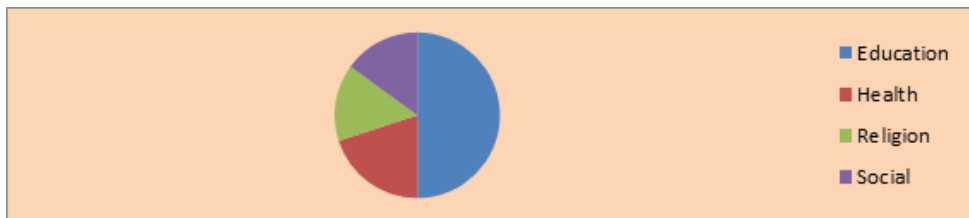
Figure 4: Presentation of Distribution of Productive Waqf Investment Results

The benefits obtained from various waqf property investment are mainly distributed for the needs of poor and orphaned children in Brunei Darussalam through various programs and activities such as fulfilling the needs of education, health and social services (Hj Mahdini, 2017). In this case, the distribution of waqf results is more dominantly used for fulfilling educational needs which reach up to 50%, followed by 20% for the health sector, 15% for the religious sector, and 15% for the social sector. The detail is displayed in the figure 4.