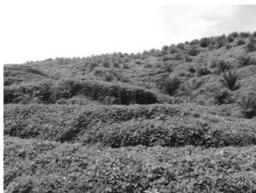
Photo 5. Bench terrace + cover crop in plot of land capability class VI (phot. Fauzan)

Soil conservation treatment on land capability class VI significantly reduced erosion and runoff more than the control treatment ( p < 0.05 ) – Table 3. The bench terrace + cover crop + manure treatment significantly reduced surface runoff by 63.59%, compared to the control treatment, followed by bench terrace + cover crop (56.16%) and bench terrace (45.26%), respectively (Photo 4). The bench terrace + cover crop + manure (P3) reduced soil erosion more than other treatments, 64.73% compared to other erosion controls. Soil nutrient leaching, runoff, and erosion were greatly influenced by the conservation treatment applied (Tab. 3 and Photo 5), in which the percentage of C-organic and total nitrogen were significantly affected by the P3 treatment. However, phosphate and potassium leaching was not affected by the treatment. In this group, bench terrace + cover crop + manure (P3) was the most effective in preventing nutrient leaching.