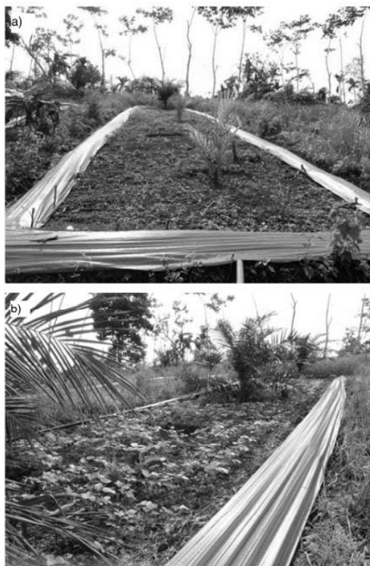
Photo 2. Soil conservation technologies applied in the experiment of land capability class IV: a) sediment trap, b) sediment trap + cover crop + manure

Soybeans are planted between rows of oil palm trees as cover crops. They are planted throughout the year, planting 3 times a year by burying. During the period of growth, soybeans are treated from pests and diseases and harvesting is