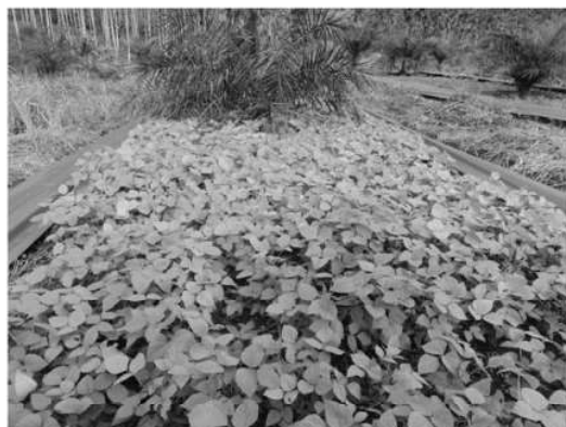
Photo 4. Individual terrace + cover crop + manure in plot of land capability class III

Explanations: LSD = least significant difference; different letter notations in the same column show significant differences on the 0.05 LSD test. Source: own study.