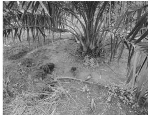
Photo 1. Individual terrace in plot of land capability class III

Individual terraces have a length and width 1.5 × 1.5 m and a depth of 20 cm (Photo 1, Fig. 1). Sediment traps are long and wide soil trenches, measuring 1.5 m long, 1 m wide, and 0.5 m depth, made in the midst of planting rows perpendicular to slope direction (Photos 2a, b). The community designed the bench terraces, perpendicular to slope direction, with 3 m width and 1.5–2 m height (Photo 3). Bench terraces were constructed when preparing land for oil palm planting. Leguminous cover crops were grown with spacing of 20 cm × 30 cm.