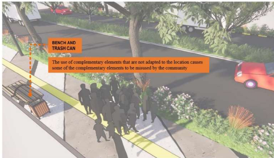
Figure 7. Typical pedestrian path design

A good pedestrian arrangement will improve the quality of the pedestrian path. The function of the pedestrian path will also be maximized as a good plant arrangement will function as a space divider, direction, ameliorate the microclimate, and improve the visual quality of the area. To make a good pedestrian path that functions optimally for the entire community, complementary elements on the pedestrian path are important factors that must be considered in the arrangement of pedestrian paths, including as benches, guideways, trash cans, lights, bollards, and shelters. With a good arrangement, it will also minimize informal sector activities that take place in the pedestrian path area.