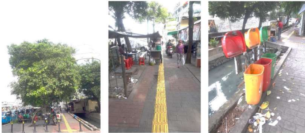
Figure 3. Existing condition of the study area (Documentation 2022)

Figure 3 shows the existing condition of the observation location on side B. The pedestrian path on side B is \pm 2 m wide, which means it meets the pedestrian path standards. However, side A pedestrian paths do not have complementary elements that meet the standards and side B pedestrian paths have complementary elements but do not function properly. Furthermore, the presence of informal sector in this area greatly interferes with the movement of pedestrians. According to the Guidelines for Building Construction Materials and Civil Engineering, Technical Planning of Pedestrian Facilities, by The Ministry of Public Works and Housing in 2018, pedestrian paths must have complementary or supporting equipment, including shelter, lights, safety fences, protective/shading plants, roadside vegetation, seats, trash bins, bollards, and guideways for users with disability.