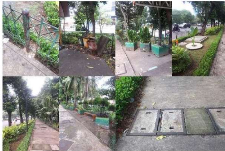
Figure 4. Existing condition of the study area (Documentation 2022)

Pedestrian paths could be a physical element that shape the city image if they are organized and have a good design concept. Physical elements of a city have the potential to add value to the city. Therefore, they need to be carefully designed and improved. Increased community activity should be proportional to the availability of public facilities and infrastructure because it influences people's comfort. Areas with varied land uses, especially those that are connected to main roads and public transportation facilities provide greater opportunities for city residents to live, work, play, exercise, shop, and fulfill other needs on foot [9].