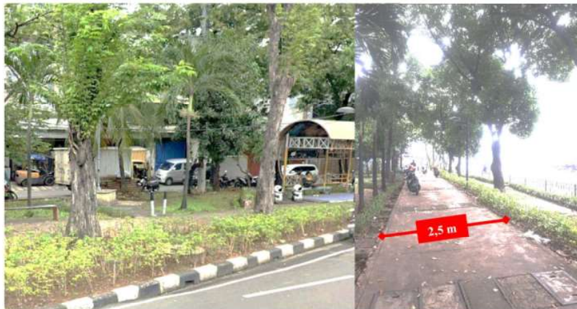
Figure 2. Existing condition of the study area (Documentation 2022)

Figure 2 shows the existing condition of side A based on the observation. Based on the current shape and condition, there are several things that meet and do not meet the standard criteria for pedestrian paths. When evaluating the width of the pedestrian path, the minimum effective width of pedestrian space for two pedestrians is 150 cm [7]. Therefore, the pedestrian path on Jalan Kyai tapa has met the standard because it has a width of \pm 2.5 m or 250 cm.