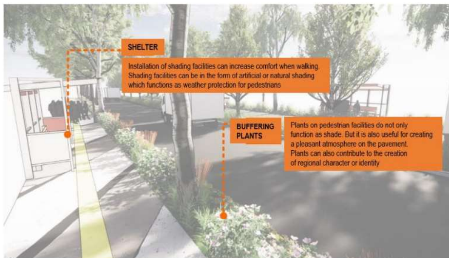
Figure 6. Typical pedestrian path design