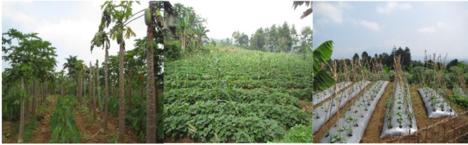
Figure 1. Agricultural landscape condition of upstream Ciliung watershed