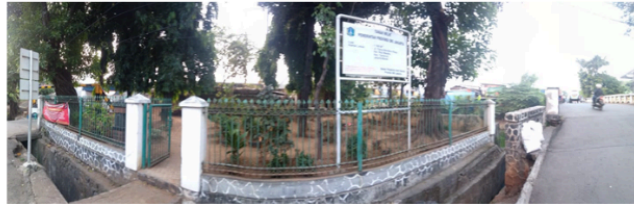
Figure 3. Image of Environmental Parks as forming a sense of community and regional spirit of place

area [9]. Findings of a sense of community in the research area. Roa Malaka Village, Tambora District. The existing condition of the area is a green open space which can be used as a social space or exhibition space outdoor museum, so that the area can build a sense of community by sharing the atmosphere, both formal and informal, which in turn will become a spirit of place to strengthen the Jembatan Kota Intan cultural heritage area which is located not far from the area. (Figure 3) Results of SWOT Analysis of Sense of Community RW 003 RT 001, Roa Malaka Village, Tambora District (Table2)