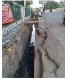
Figure 4. Image of clean water channels in the Environmental Park in Tambora District

Results of SWOT Analysis of Sense of Risk RW 003 RT 001, Roa Malaka Village, Tambora District (Table 3)