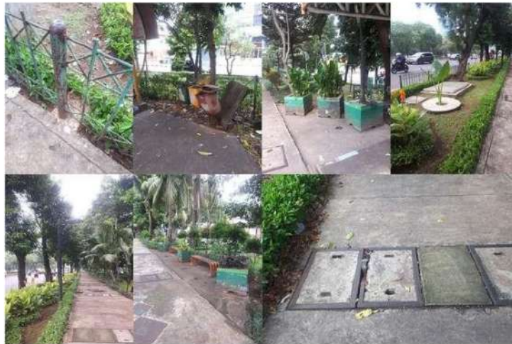
Figure 4. Existing condition of the study area (Documentation 2022)

Pedestrian paths could be a physical element that shape the city image if they are organized and have a good design concept. Physical elements of a city have the potential to add value to the city. Therefore, they need to be carefully designed and improved. Increased community activity should be proportional to the availability of public facilities and infrastructure because it influences people's comfort. Areas with varied land uses, especially those that are connected to main roads and public transportation facilities provide greater opportunities for city residents to live, work, play, exercise, shop, and fulfill other needs on foot [9].