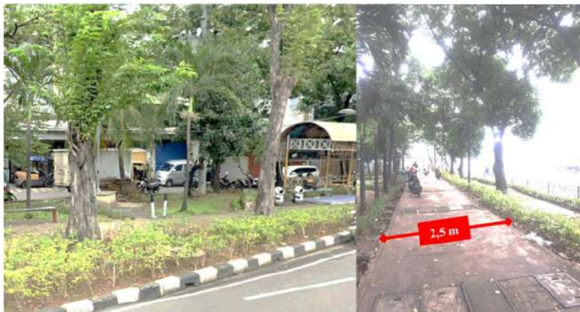
Figure 2. Existing condition of the study area (Documentation 2022)

Figure 2 shows the existing condition of side A based on the observation. Based on the current shape and condition, there are several things that meet and do not meet the standard criteria for pedestrian paths. When evaluating the width of the pedestrian path, the minimum effective width of pedestrian space for two pedestrians is 150 cm [7]. Therefore, the pedestrian path on Jalan Kyai tapa has met the standard because it has a width of \pm 2.5 m or 250 cm.