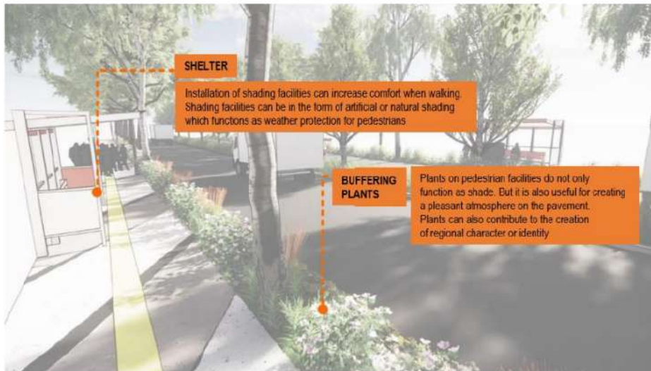
Figure 6. Typical pedestrian path design