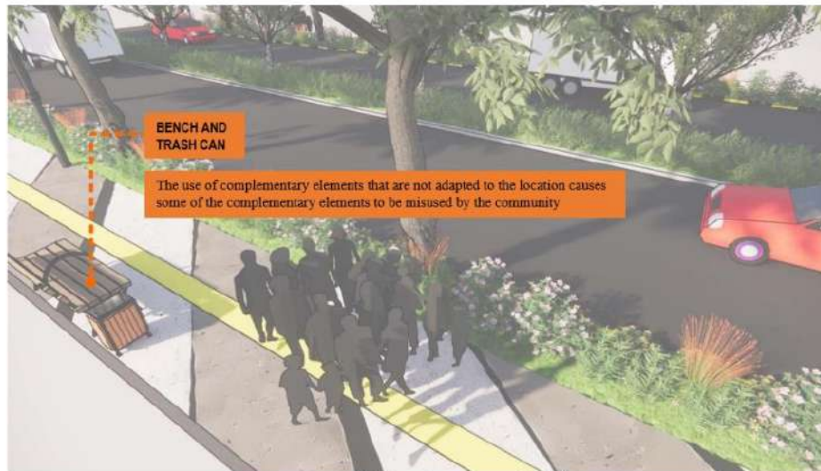
Figure 7. Typical pedestrian path design

A good pedestrian arrangement will improve the quality of the pedestrian path. The function of the pedestrian path will also be maximized as a good plant arrangement will function as a space divider, direction, ameliorate the microclimate, and improve the visual quality of the area. To make a good pedestrian path that functions optimally for the entire community, complementary elements on the pedestrian path are important factors that must be considered in the arrangement of pedestrian paths, including as benches, guideways, trash cans, lights, bollards, and shelters. With a good arrangement, it will also minimize informal sector activities that take place in the pedestrian path area.