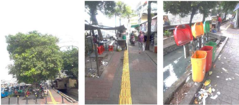
Figure 3. Existing condition of the study area (Documentation 2022)

Figure 3 shows the existing condition of the observation location on side B. The pedestrian path on side B is \pm 2 m wide, which means it meets the pedestrian path standards. However, side A pedestrian paths do not have complementary elements that meet the standards and side B pedestrian paths have complementary elements but do not function properly. Furthermore, the presence of informal sector in this area greatly interferes with the movement of pedestrians. According to the Guidelines for Building Construction Materials and Civil Engineering, Technical Planning of Pedestrian Facilities, by The Ministry of Public Works and Housing in 2018, pedestrian paths must have complementary or supporting equipment, including shelter, lights, safety fences, protective/shading plants, roadside vegetation, seats, trash bins, bollards, and guideways for users with disability.