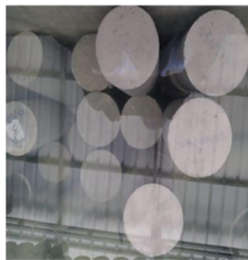
Figure 3 Water submerged curing