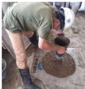
Figure 2 Slump Flow Test

Concrete tests were conducted on fresh and hardened concrete. To test the workability of fresh concrete, the slump test was carried out in accordance with ASTM C1611 standard, as shown in Figure 2. Meanwhile, the hard concrete test was carried out at the age of 3, 7 and 28 days using 100 mm x 200 mm cylindrical specimens that had been treated with the Water Submerged Curing (WSC) method according to the ASTM C31 standard. Concrete treatment with the curing method is shown in Figure 3.