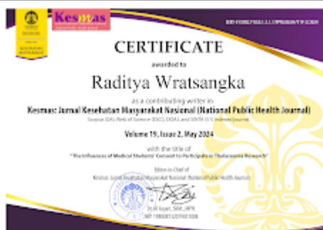
Raditya Wratsangka.png 2024K