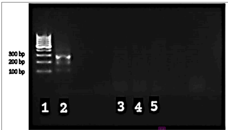
Figure 3. Gel Electrophoresis of Extracted DNA from Sputum Samples. Lane M: 100 Bp DNA Ladder; Lane 1: Negative Control; Lane 2: Positive Control DNA from Paragonimus westermani ; Lanes 3–5: Clinical Sputum Samples with No Visible Paragonimus -Specific Amplification Bands