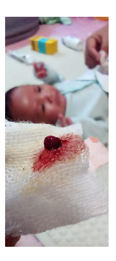
Figure 7 Detachment of the granuloma

There were no serious complications observed throughout the treatment course, though some mild skin irritation was noted (Fig. 8) and managed effectively with correct cleaning and dressing protocols. The outcome of using a 0.5 gram NaCl capsule in this case illustrated highly satisfactory results. By the third day, there was a notable decrease in granuloma size, it became paler and drier (Fig. 9). Parents reported simplicity in home administration, enhanced comfort for the infant, reduced need for repeat healthcare visits, and expressed high satisfaction due to the low cost and rapid effectiveness.