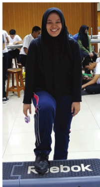
Figure 1 Harvard Step Test

and the results showed that HR before exercise was normal in both gender; however, the HR before and after exercise were higher in females ( p=0.03 ) and ( p<0.001 ). The La^{-1} concentration (before exercise) in males was higher than the normal value and also higher than that of females ( p=0.001 ). This result is in contrast with an earlier study that found the La^{-1} in females is higher. A previous study has revealed that a body fat level of more than 15% is linked to a higher La^{-1} . 11 Unfortunately, this study did not assess the body composition that might be able to explain why the male La^{-1} in this study was higher. The concentration of La^{-2} after exercise increased in both gender and was higher significantly in females ( p<0.001 ). This finding supports the theory stating that during short and high intensity PA, the skeletal muscle produces La^{-1} more rapidly that is followed by increasing concentration in the circulation. 7,8 Previous studies have proven that increased blood lactic acid after exercise is a prognosis determinant in subjects with dyslipidemia, congestive heart disease, and chronic obstructive pulmonary disease. 3,11