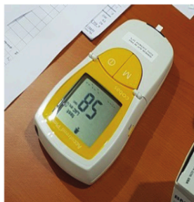
Figure 2 Portable analyzer operator © Accutrend plus by Roche to Assess Lactic Acid

Data in Table 2 show that females have higher La^{-1} concentration and HR after exercise. Females have smaller skeletal muscles, causing the ability to consume oxygen of these muscle lower. This result supports the findings from previous studies that blood La^{-1} and HR increases after exercise are higher in females. 7,8 Furthermore,