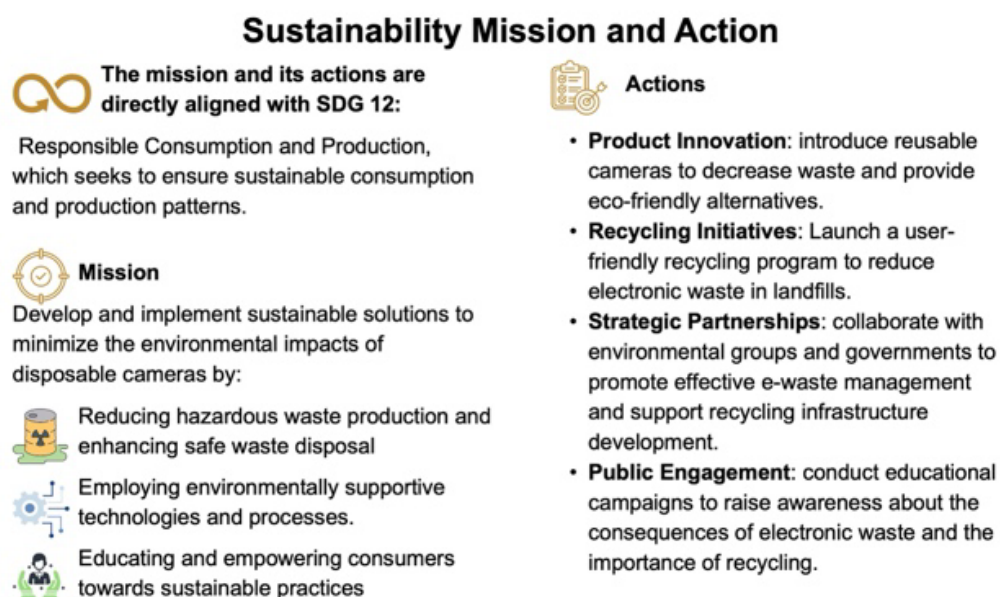
Figure 2. Sustainability and action

investment will help in creating a demand for sustainable products. However, a large-scale educational campaign requires a significant budget that may not be readily available among small and medium enterprises. In addition, the effectiveness of this form of campaign depends on the effectiveness of media channels and their ability to reach a diverse range of market segments, be they geographically or demographically.