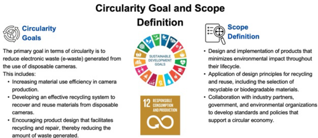
Figure 1. Four strategic dimensions to create a sustainable circular economic system

This study resulted in a comprehensive circular business model to tackle challenges of electronic waste produced by disposable camera industry in Indonesia. By applying an adapted Circular Business Model Canvas, we have identified four integrated strategic dimensions to create a sustainable circular economic system (Figure 1). Each dimension offers a unique contribution to the formulation of a business ecosystem that is able to shift the production and consumption paradigm within the camera industry.